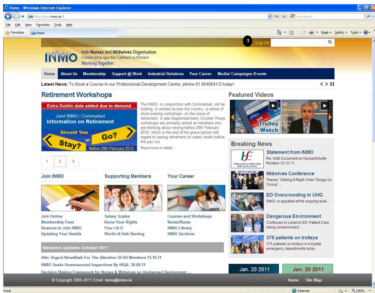
Figure 1.1: INMO Home

Step 2: On the INMO Home page, click the Log On button ( Figure 1.1, Label 1 ) made available at the top right corner of the screen.