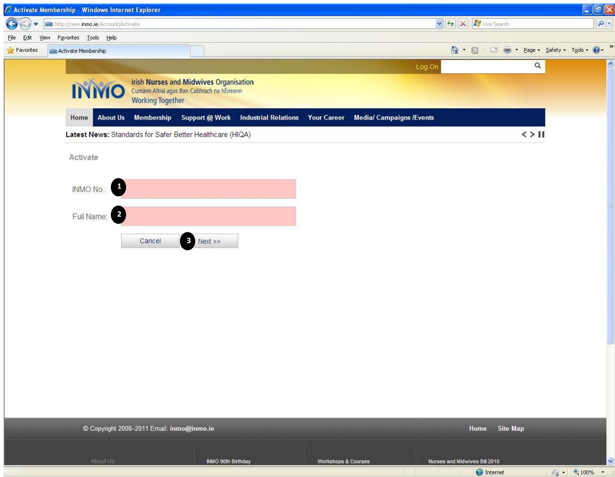
Figure 2.3: Activate Membership Screen